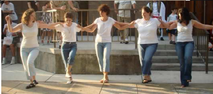
(left) The 50 th Anniversary Reunion Dancers re-living festival fun.

Thanks to all our volunteers & donors who helped make it a success!