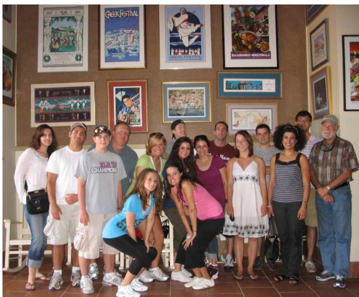
The team visits the Greek church in New Orleans, where annual festival poster art is displayed.

And that putting your muscle where your mouth is a great feeling. In my opinion, that IOCC and Habitat have done a great job in responding to this 4-year old crisis. It was amazing to see young Orthodox kids donating their time and energy, when our government has done so little to respond.