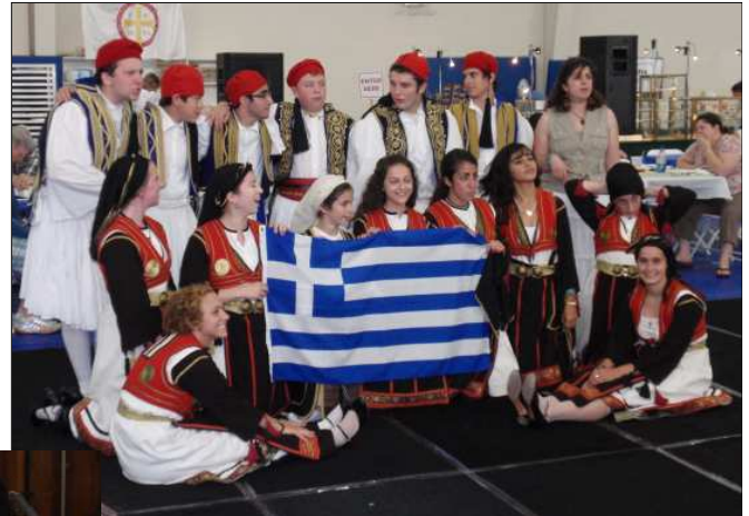
(above, left) The Junior Dancers entertaining the Taverna crowds