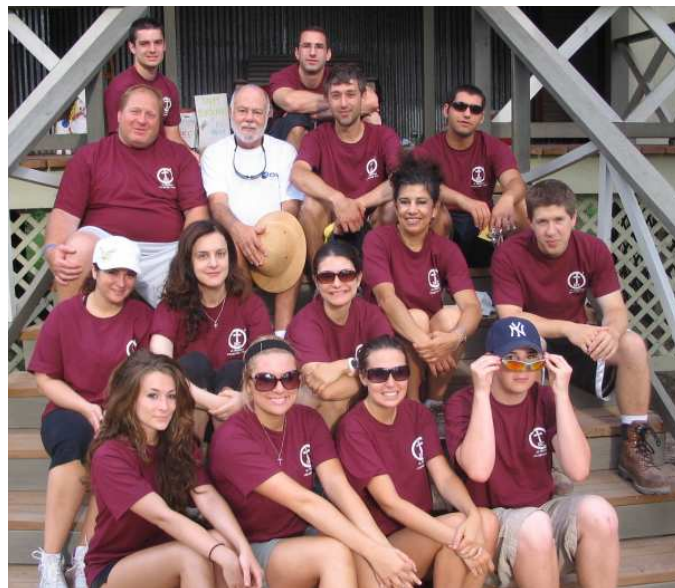
(above) The last IOCC team of the 2009 season at one of their work sites. Bishop Demetrios is the one in the white shirt.

Habitat homes are 1,100-1,300 square feet with 3-4 bedrooms and are worth approximately $135,000 in that market (although they only cost $89,000 to build with volunteer labor) and are sold to homeowners for $75,000.